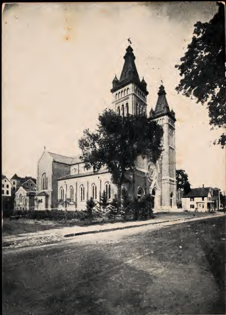
ST. MARY'S CHURCH, WILLIMANTIC, CONN.